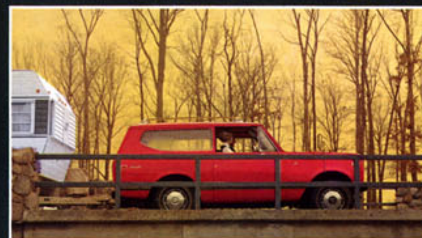
New Smoothie. Body and engine rest on rubber "cushions" to remarkably reduce vibration and noise.