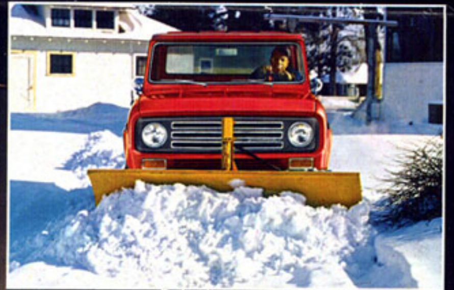
Muscles for moving. Scout II is a year 'round workhorse. It can be equipped with an electric or hydraulic snow plow, transfer case power take off, front tow hook and rear tow loop.