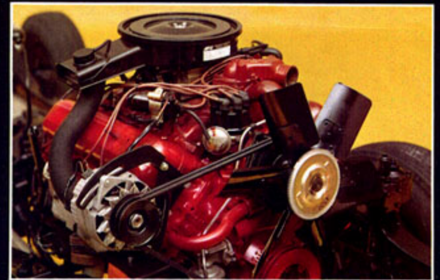
Power-packed V-8. A 345 cubic incher that delivers all the power you'll ever want. Meets all emission requirements. Available with automatic choke, and modulated fan to save gas.