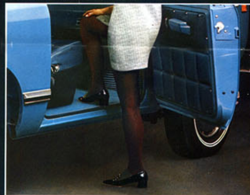
On the level. Floor and door frame are same height. No stepping down into a well or up to get into the back seat.